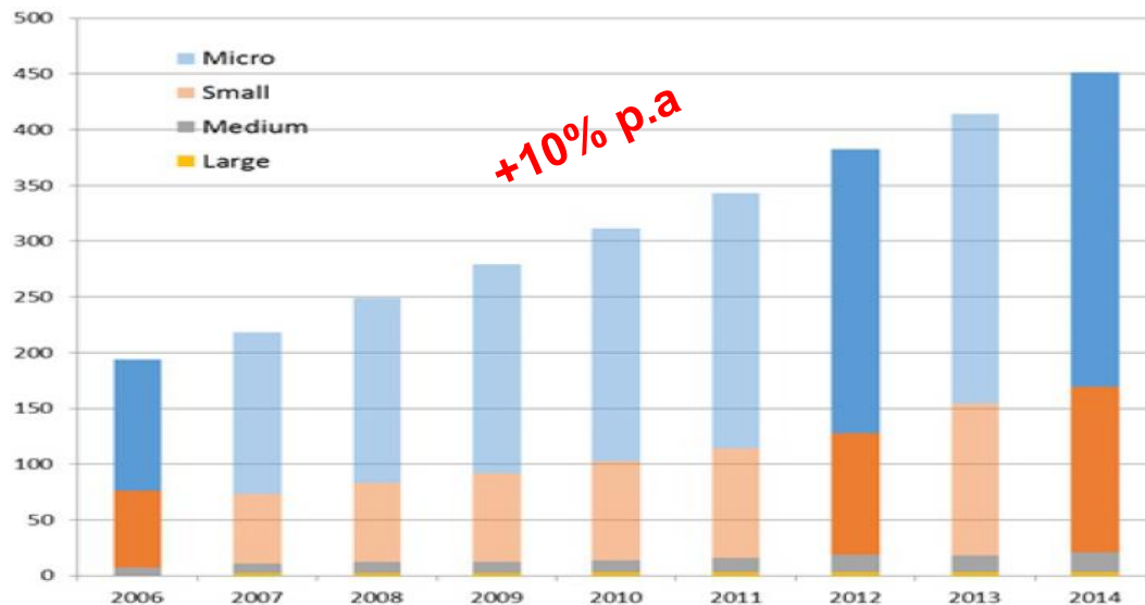
Number of Earth Observation companies in Europe